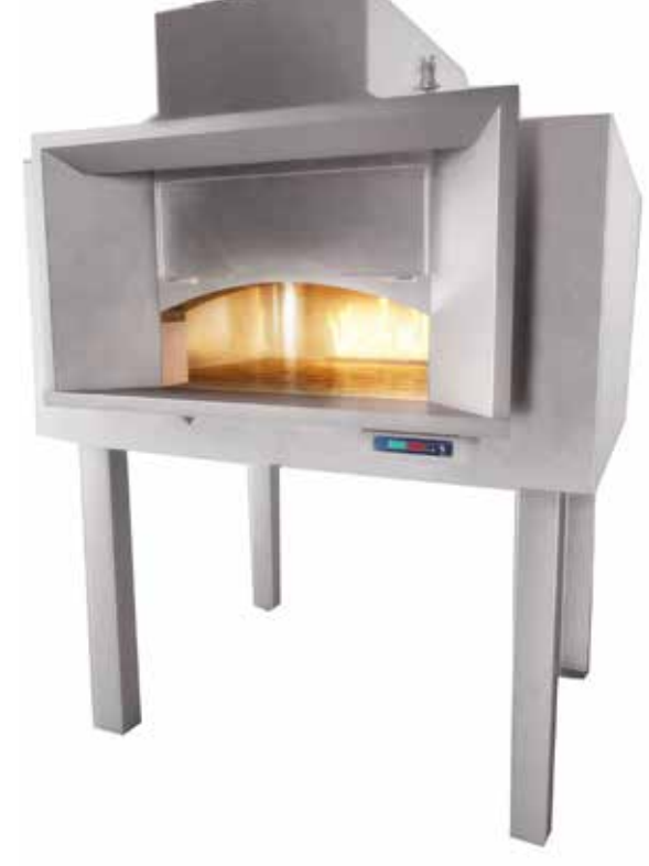
High performance fold down door model shown, high profile glass door design also available for selected Flametree series ovens.